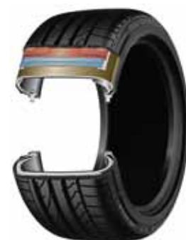
THE POTENZA RE050 RFT

To reinforce its commitment to the technology, Bridgestone UK has increased the level of investment in its RFT training programme for 2005 and 2006.