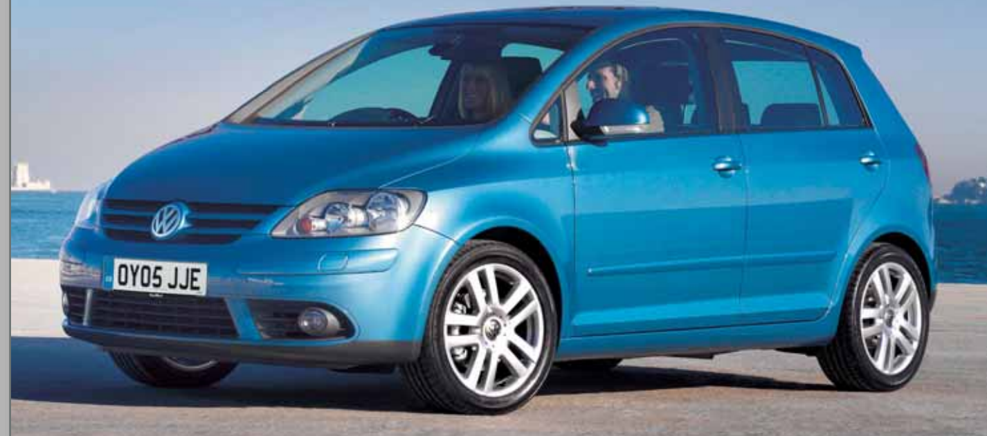
THE VERSATILE NEW GOLF PLUS