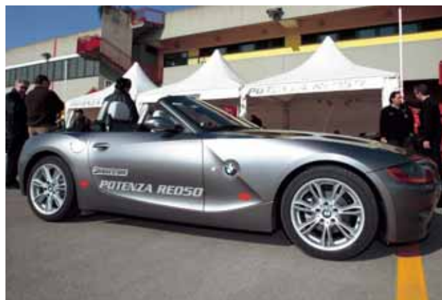
THE BMW Z4: ONE OF MANY TOP MARQUES TO FIT BRIDGESTONE RUN-FLAT TYRES AS ORIGINAL EQUIPMENT

For information about attending one of Bridgestone's RFT training schemes, please contact 0808 1800 800.