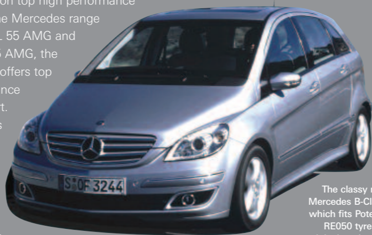
The classy new Mercedes B-Class, which fits Potenza RE050 tyres as original equipment

Already proven on top high performance sports cars in the Mercedes range including the SL 55 AMG and the new CLS 55 AMG, the Potenza RE050 offers top sports performance and ride comfort. It also enhances vehicle handling at high speeds and improves performance in the wet and dry. Sales of the B-Class are expected to reach 6,000 in the first year, so tyre dealers can expect to see them on their forecourts soon. It will fit Bridgestone Potenza RE050 tyres in the 215/45 R17 size.