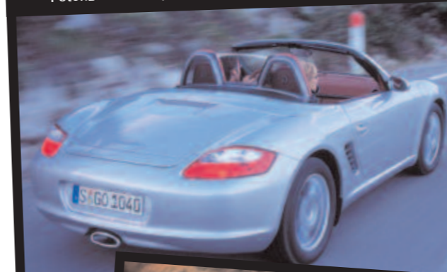
It's a close second for the Porsche Boxster, which fits Potenza RE050 tyres