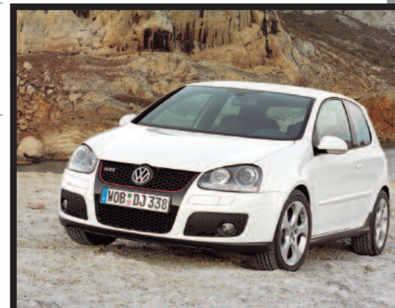
The Volkswagen Golf GTi: The Greatest Drive of 2005, according to Auto Express

The Golf narrowly beat the second placed Porsche Boxster, which also fits Potenza RE050 tyres, and third placed Nissan 350Z, which fits Potenza RE040 tyres.