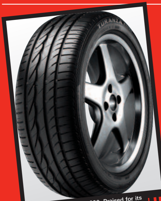
The Turanza ER300: Praised for its almost perfect dry handling ability

Bridgestone praised for dry handling in independent tyre test