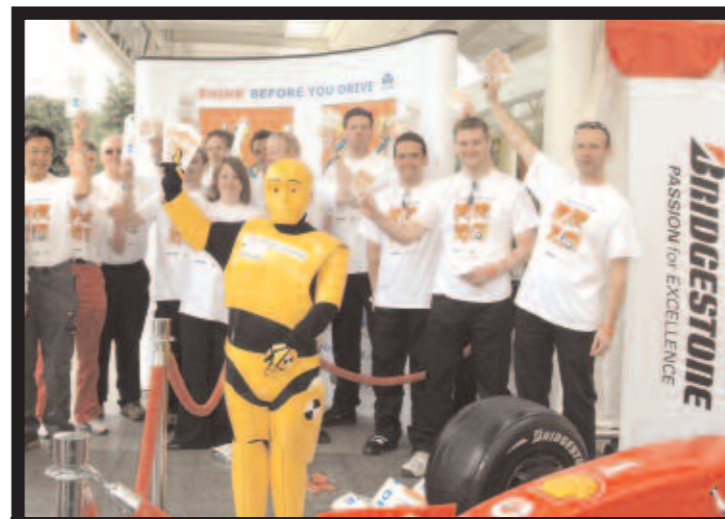
Bridgestone tyre testers and the campaign icon – a crash test dummy – launch the Think Before You Drive campaign

The Think Before You Drive campaign was launched during the British Grand Prix weekend, promoting tyre safety and awareness to the public.