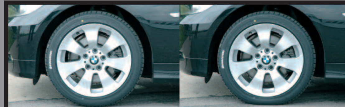
Spot the difference: Bridgestone Potenza RE050 RFT Fully inflated (left) and deflated (right)

For more information on taking part in Bridgestone training courses, call 0808 1800 800.